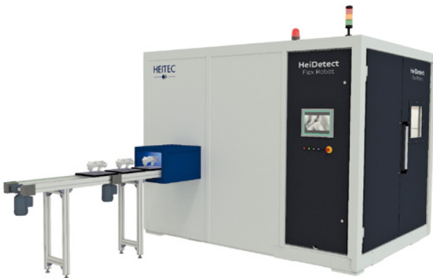
Continuous conveyor technology