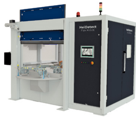
Loading via rotary table